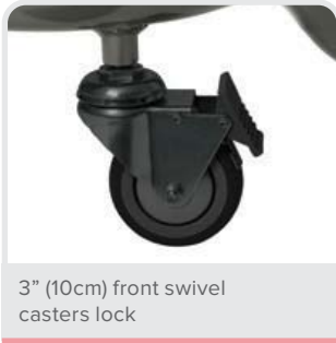
3" (10cm) front swivel casters lock