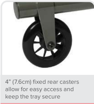
4" (7.6cm) fixed rear casters allow for easy access and keep the tray secure